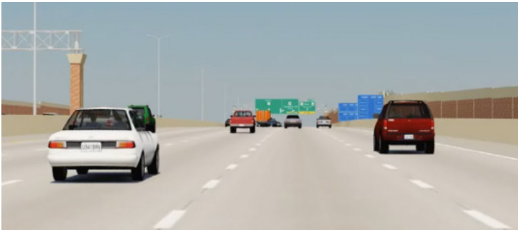
Planned noise barriers along I-41 mainline